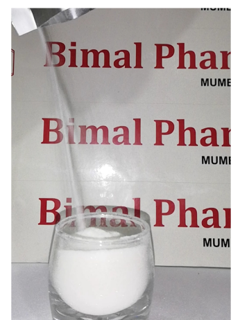
SORBIC ACID, E – 200 GOOD FLOW ABILITY