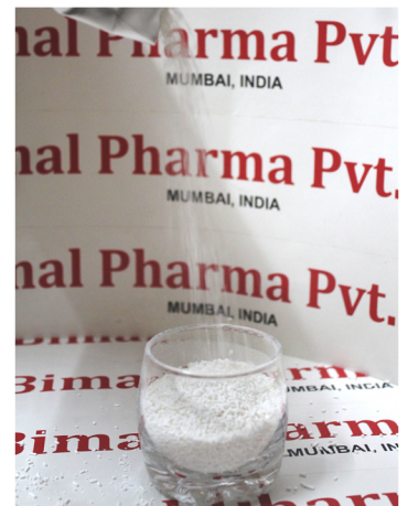
POTASSIUM SORBATE, E – 202 GOOD FLOW ABILITY

5. We offer the Product with “Minimum Water Content”, 0.2% Against Limit of 1.0%